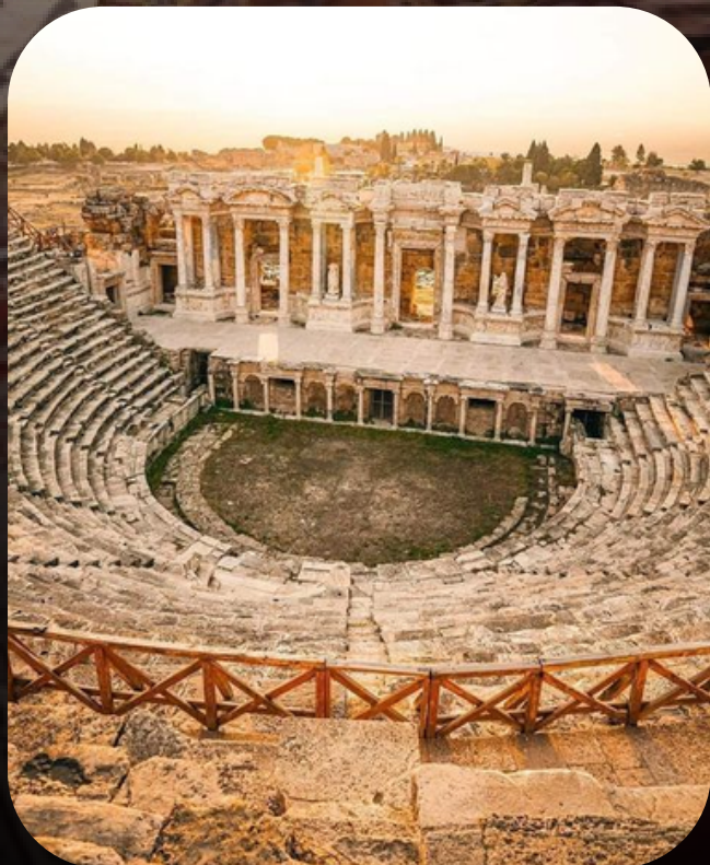
ANTIQUE CITY OF HIERAPOLIS